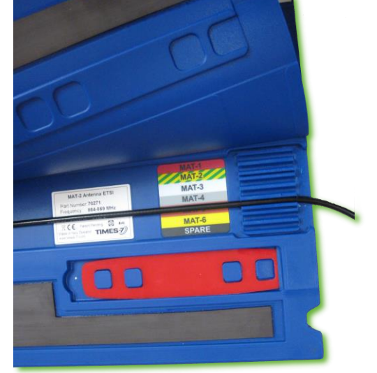
Integrated cable channels – Cable detail

Event and race-proven, the SlimLine RTAS has been extensively stress and performance-tested in hundreds of events around the world, putting this complete race timing antenna system in a class of its own.