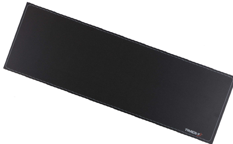
The A6590L Ground Antenna

Ultra-low profile linear polarised UHF ground antenna